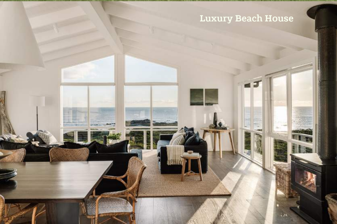
Luxury Beach House