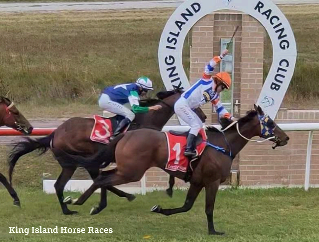
King Island Horse Races