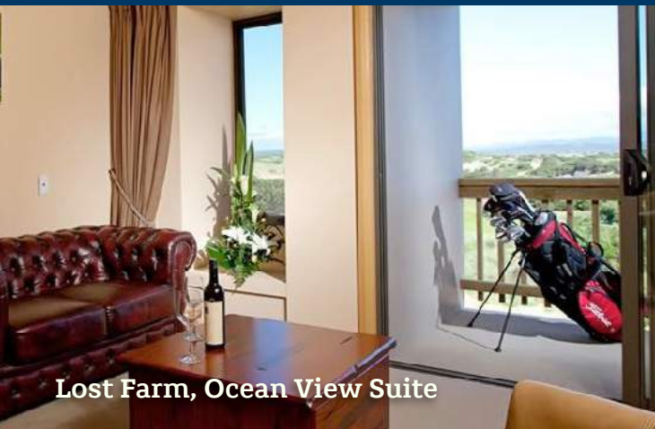
Lost Farm, Ocean View Suite