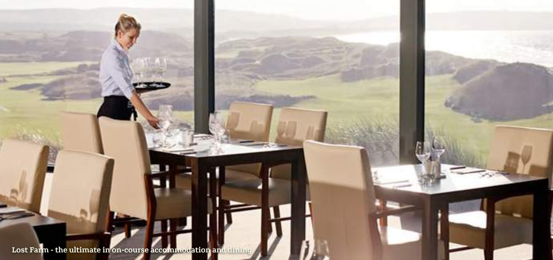
Lost Farm - the ultimate in on-course accommodation and dining