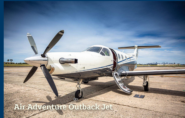
Air Adventure Outback Jet