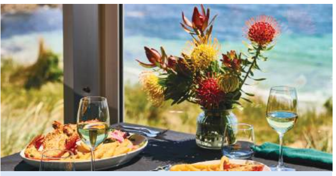
King Island Crayfish

With over $10,000 of prizes on offer, you will have the opportunity to win some of the most sought-after products on the market from event partner Callaway , an industry leader in innovation and performance. Each player will also receive a Welcome Gift which will include a Travis Mathew polo , Callaway tour cap and Chrome Tour golf balls .