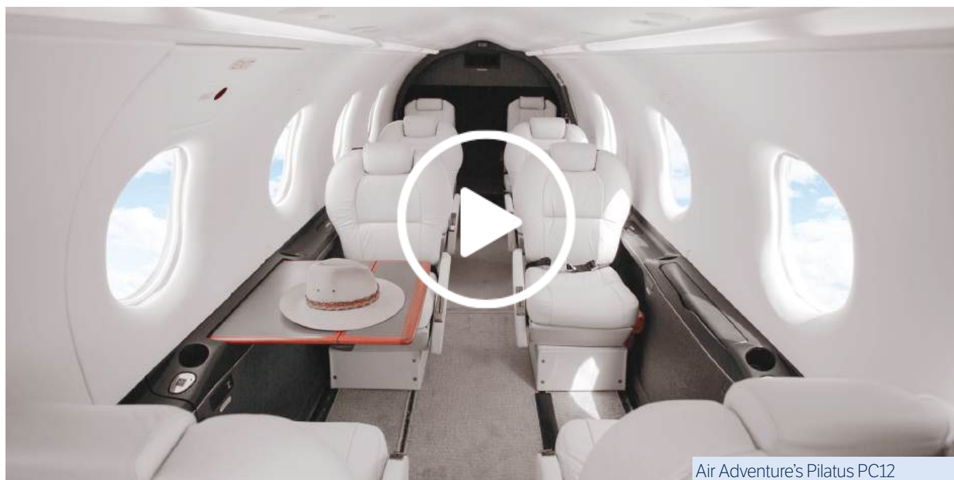
Air Adventure's Pilatus PC12

Based on a group of 8. See the following page for full inclusions.