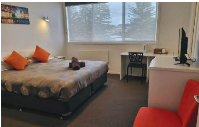
King Island Hotel

Staying on course includes a complimentary upgrade to all-day golf, allowing you to make the most of your experience.