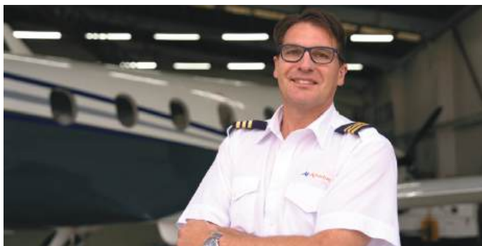
Experienced Commercial Pilots