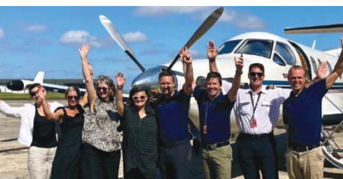
Small Group Travel