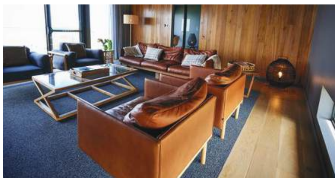
King Island Lodge