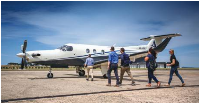
Air Adventure's Pilatus PC12