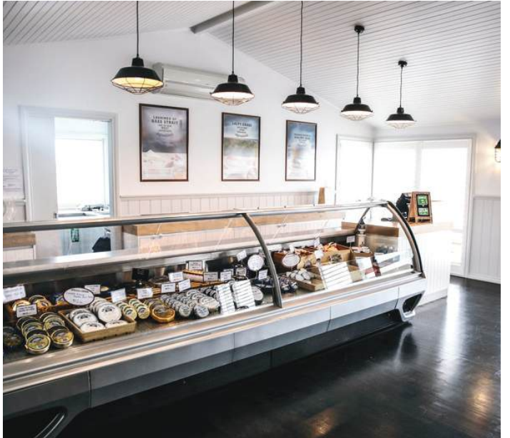
King Island Dairy