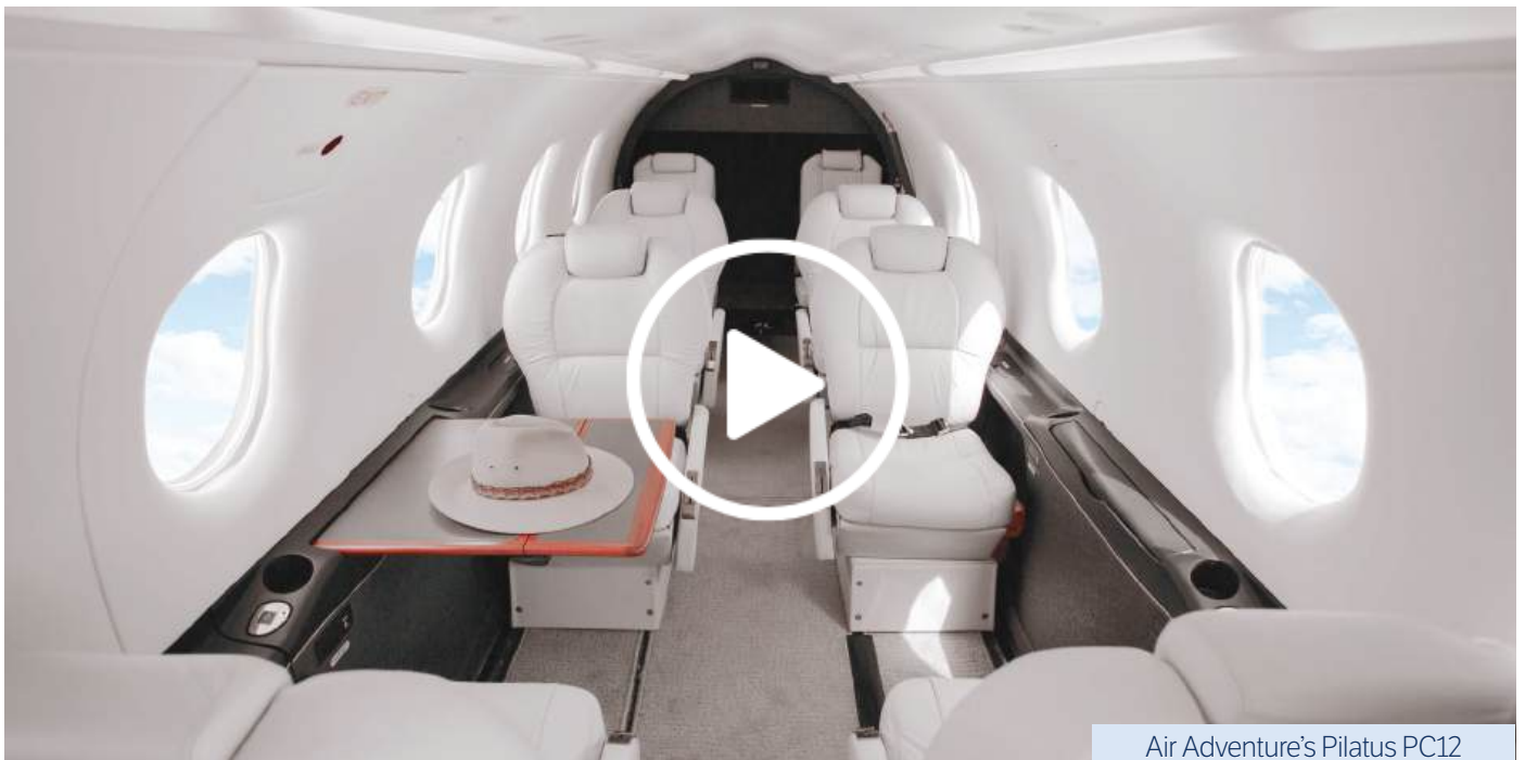
Air Adventure's Pilatus PC12

Based on a group of 8. See the following page for full inclusions.