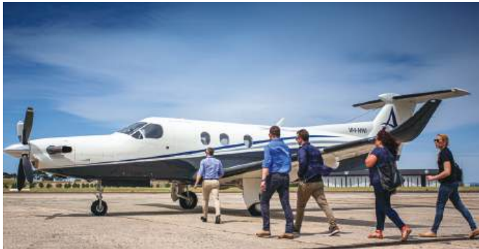
Air Adventure's Pilatus PC12