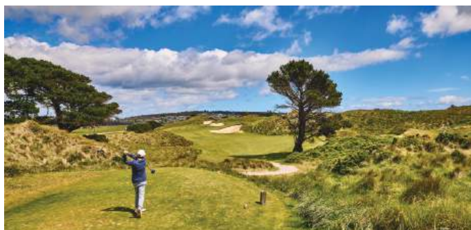
Two Person Teams Event