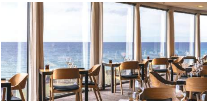
Lost Farm Lodge Restaurant

You will play for amazing prizes valued at over $5000 and each player will receive a Welcome Pack valued at $120.