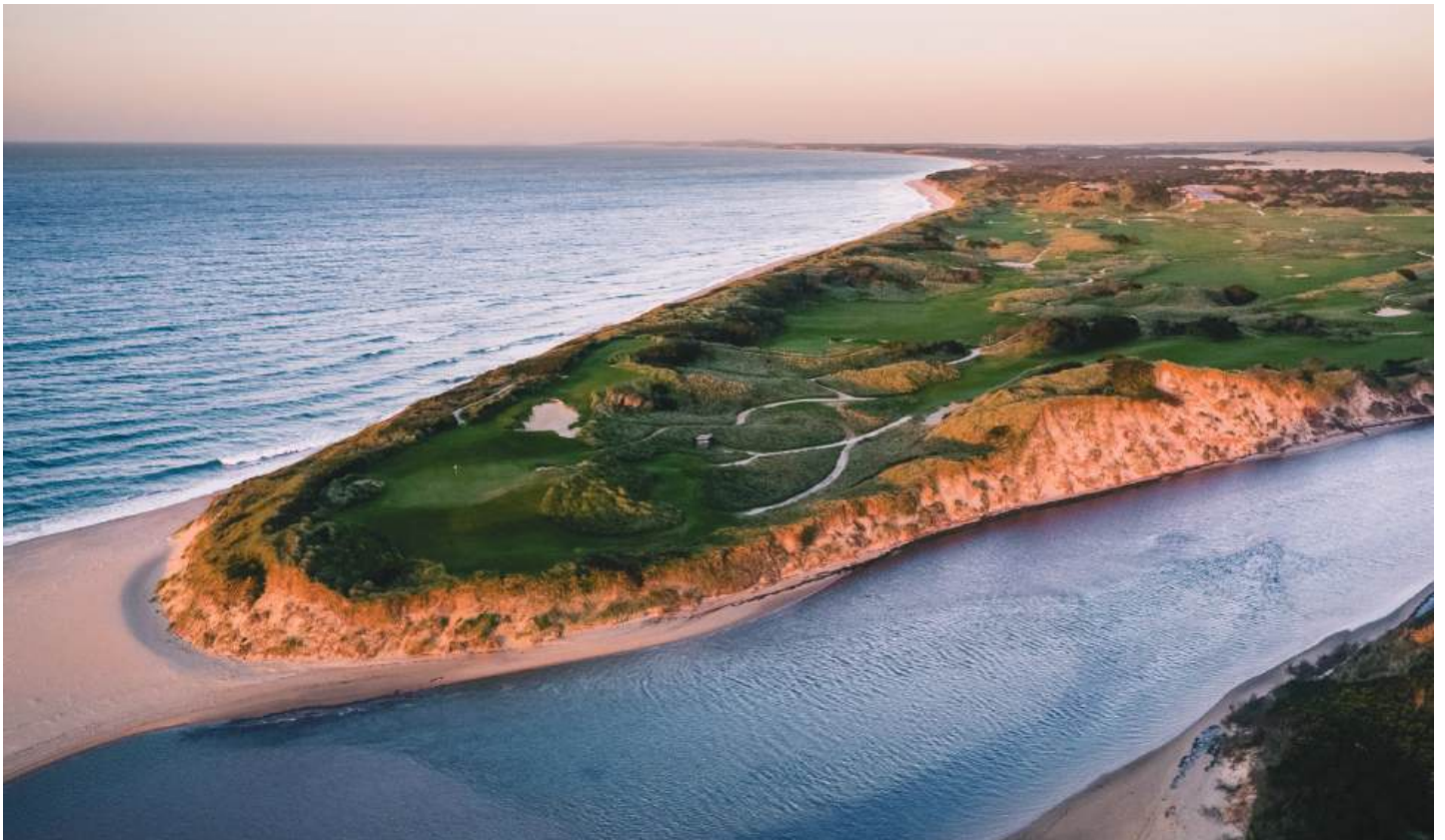
Barnbougle Lost Farm

The round will be followed by presentations and transfers back to Launceston Airport for self-organised flights. Those flying on the Air Adventure's Pilatus PC will take off from the course bound for Essendon.