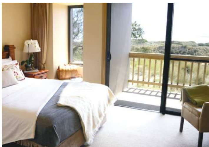
Lost Farm Lodge