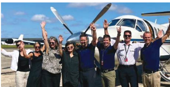
Small Group Travel

You'll have professional assistance when needed and you will be talking to a real person.