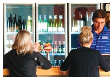
Lost Farm Sports Bar