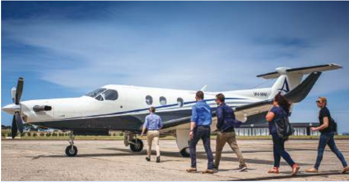
Air Adventure's Pilatus PC12