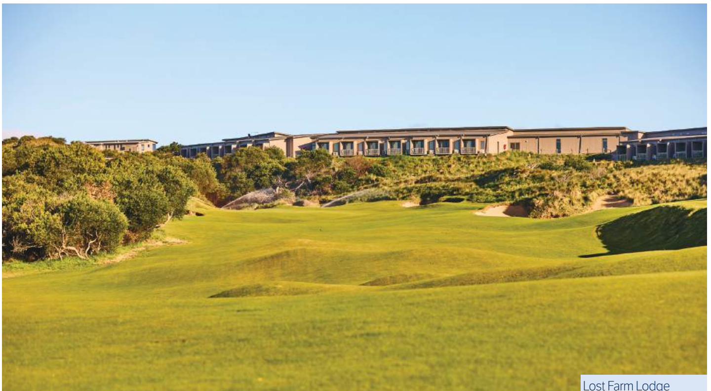
Lost Farm Lodge

NB: above times are indicative only and can be altered to suit your group subject to availability.