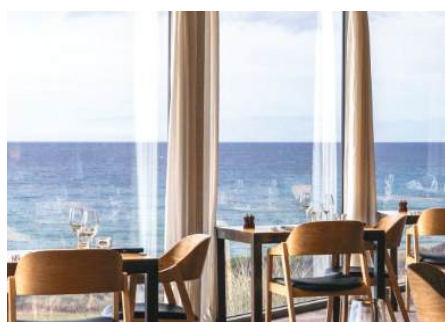
Lost Farm Restaurant