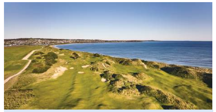
Everthing Arranged For You