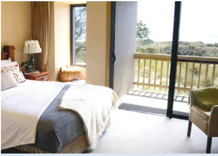
Lost Farm Lodge